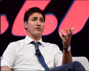
JUSTIN TRUDEAU Prime Minister Government of Canada