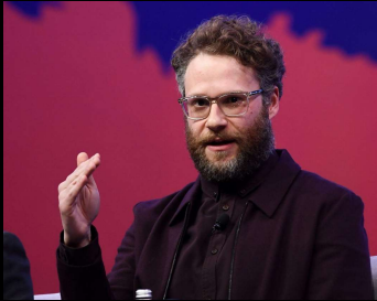
SETH ROGEN Co-founder Houseplant