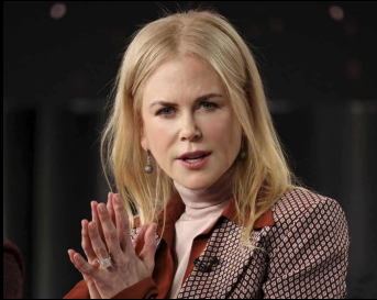
NICOLE KIDMAN Actor & Producer