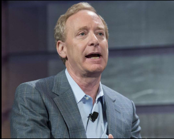
BRAD SMITH President Microsoft