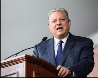
AL GORE Chairman Generation Investment Management