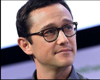
JOSEPH GORDON-LEVITT Actor, Filmmaker & Entrepreneur HitRecord