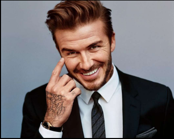
DAVID BECKHAM Goodwill Ambassador UNICEF